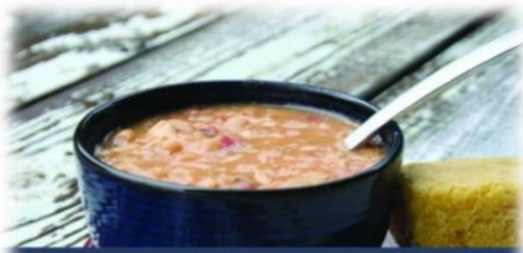
Ham & Bean Dinner